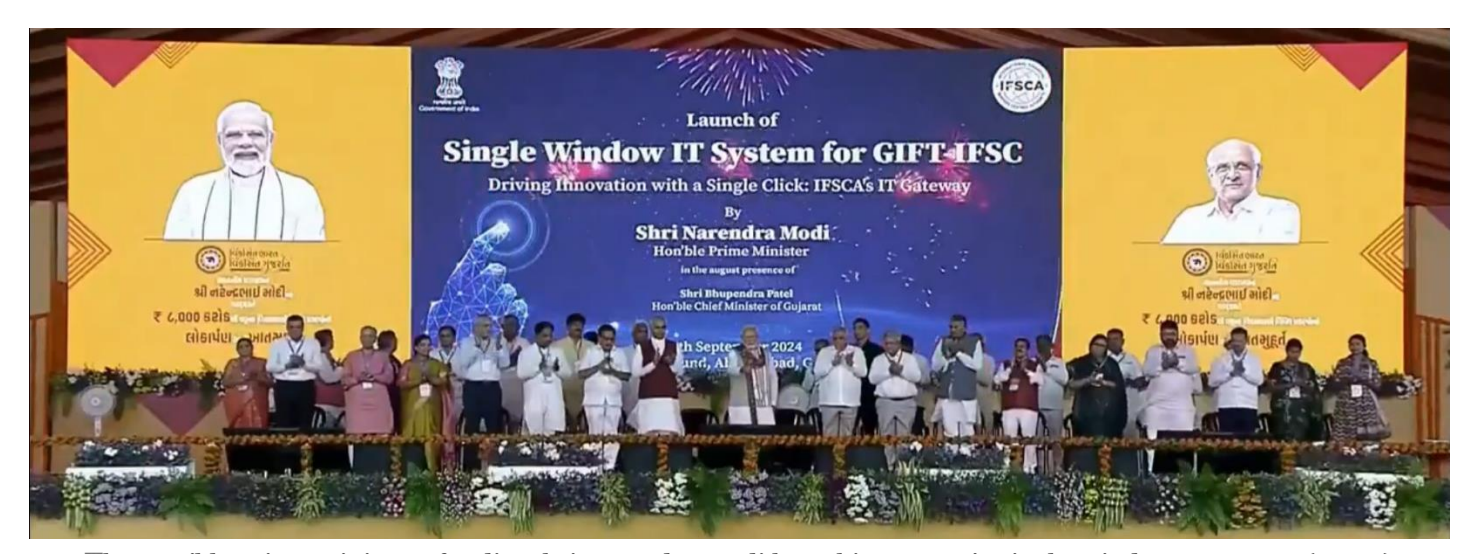
The Hon'ble Prime Minister of India, Shri Narendra Modi launching IFSCA's Single Window IT System (SWIT)