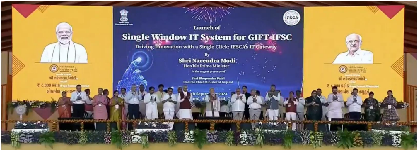
The Hon'ble Prime Minister of India, Shri Narendra Modi launching IFSCA's Single Window IT System (SWIT)