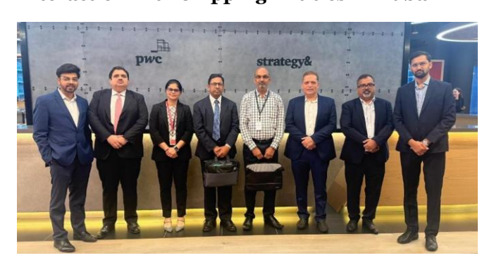
Conference on 'Booking Accounting Taxation & Financial Compliance Services (BATF) Opportunities in GIFT IFSC'

During the IFSCA delegation visit to Dubai, the ICAI (Dubai) Chapter – NPIO organised an engaging session to explore professional opportunities within India's IFSC.